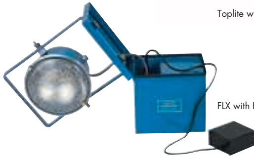
FLX with FL-F87A charger