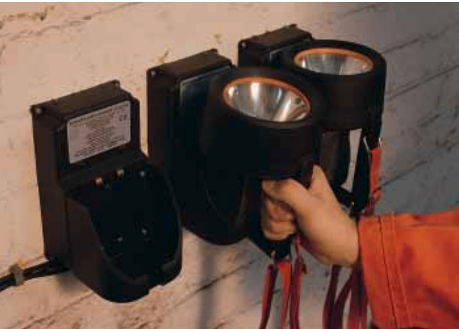
Wolflite H-251 Mk2 with C-251 HV charger