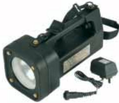
Toplite with TL-9052T3 charger