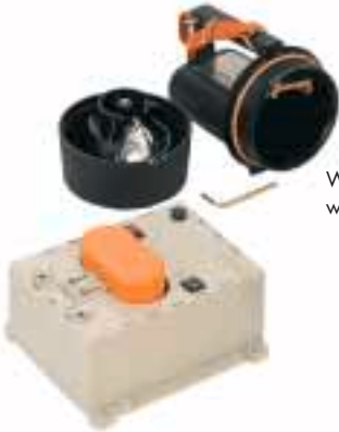
Wolflite H-251 Mk1 with C-251 charger