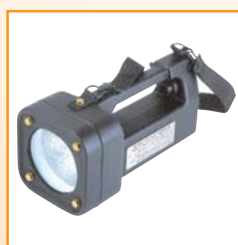
Toplite Hand Held Searchlight

The Wolf Safety Lamp Company is the market leading manufacturer of the most comprehensive range of portable 'Ex' explosion protected lighting products available.