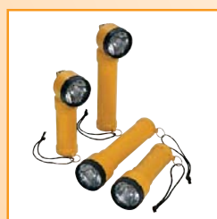
Intrinsically Safe Flashlights